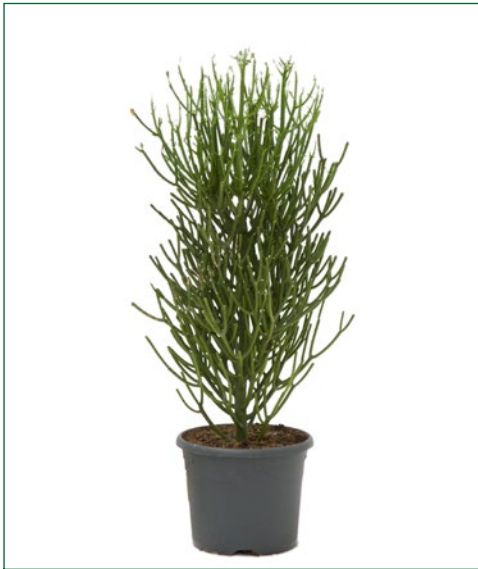
Artcode: 4EUTIKK09 Description: Euphorbia tirucalli Variety: Bush Pot: 26 Height: 100