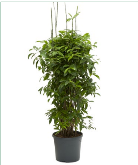
Artcode: 4DRSUBU39 Description: Dracaena surculosa Variety: Bush Pot: 35 Height: 180