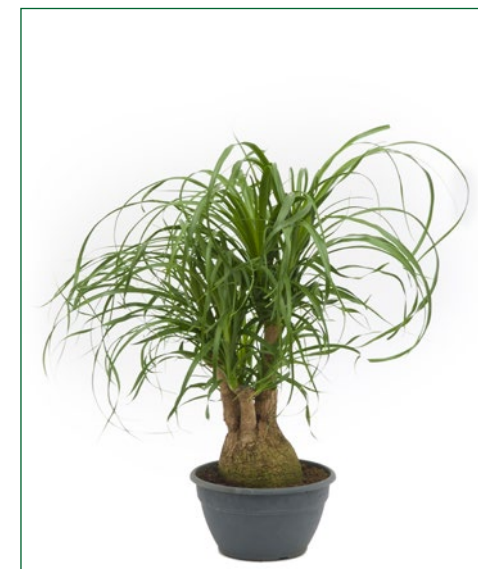
Artcode: 4BEREVT04 Description: Beaucarnea recurvata Variety: Branched (25) saucer ø15 Pot: 20 Height: 60