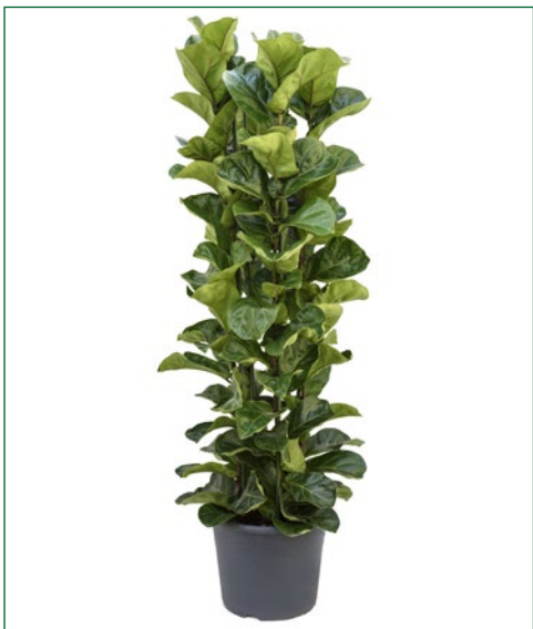
Artcode: 4FILB4T15 Description: Ficus lyrata bambino Variety: Toef 4pp Pot: 35 Height: 150