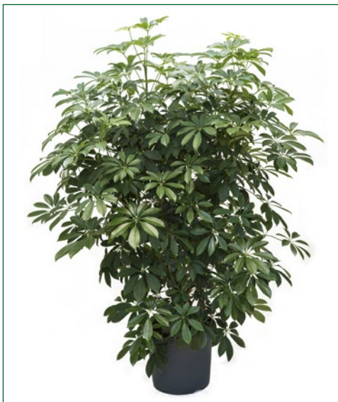
Artcode: 4SCARVT30 Description: Schefflera arboricola Variety: Branched Pot: 31 Height: 130