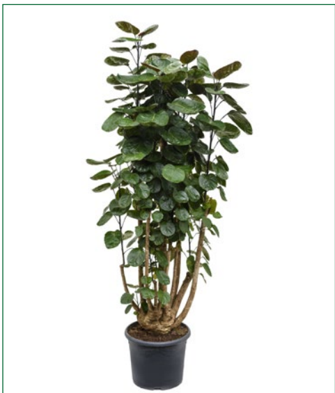
Artcode: 4POFAVT42 Description: Aralia (polyscias) fabian Variety: Branched Pot: 29 Height: 160