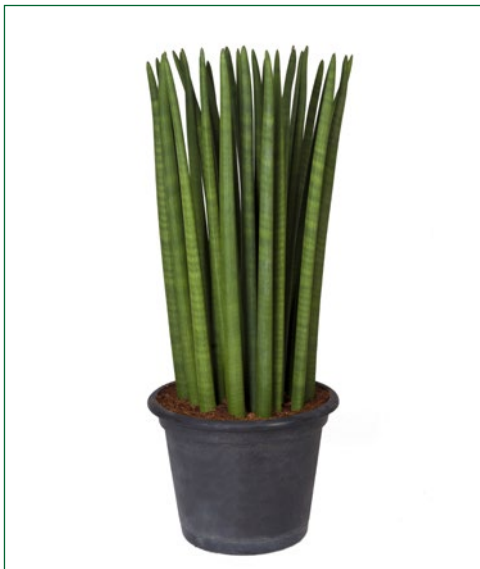
Artcode: 4SACSTU60 Description: Sansevieria straight Variety: Tuft Pot: 35 Height: 100