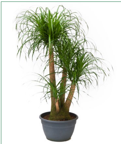
Artcode: 4BEREVT83 Description: Beaucarnea recurvata Variety: Branched (80) Pot: 35 Height: 130