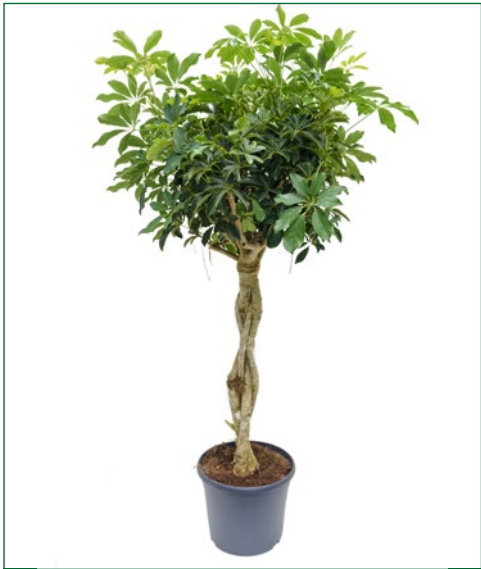
Artcode: 4SCARGS27 Description: Schefflera arboricola Variety: Stem braided Pot: 35 Height: 160