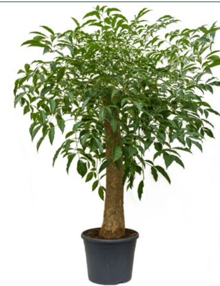
Artcode: 4HECHRS10 Description: Heteropanax chinensis Variety: Stem Pot: 35 Height: 150