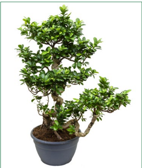
Artcode: 4FIMIHA06 Description: Ficus microcarpa compacta Variety: S-stem cascade Pot: 35 Height: 120