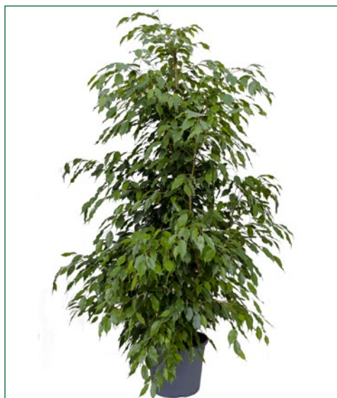
Artcode: 4FIBE1T21 Description: Ficus benjamina Variety: Tuft Pot: 35 Height: 180