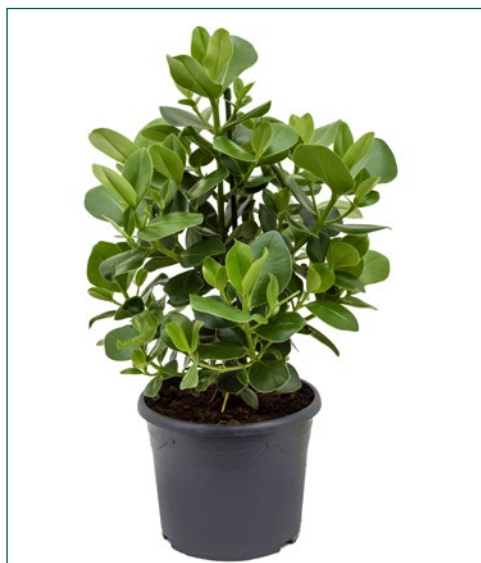
Artcode: 4CLRP1T08 Description: Clusia rosea princess Variety: Bush 1pp Pot: 29 Height: 80