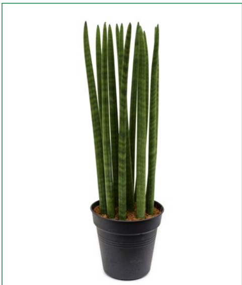
Artcode: 4SACSTU57 Description: Sansevieria straight Variety: Tuft Pot: 21 Height: 70