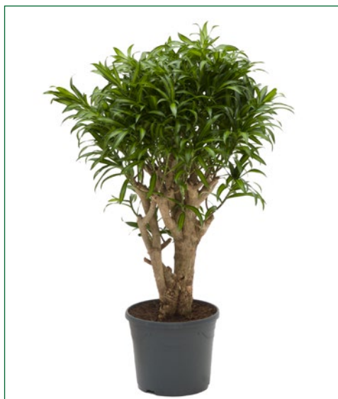
Artcode: 4PLSJT22 Description: Pleomele song of jamaica Variety: Branched Pot: 29 Height: 90