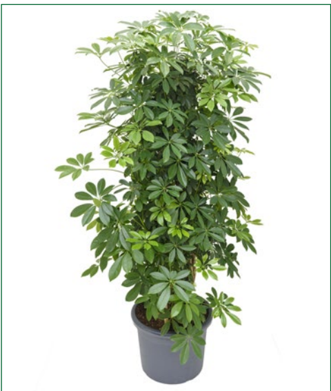
Artcode: 4SCARSS48 Description: Schefflera arboricola Variety: Branched/column Pot: 40 Height: 170