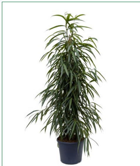
Artcode: 4FIAL1T18 Description: Ficus alii Variety: Tuft Pot: 35 Height: 150