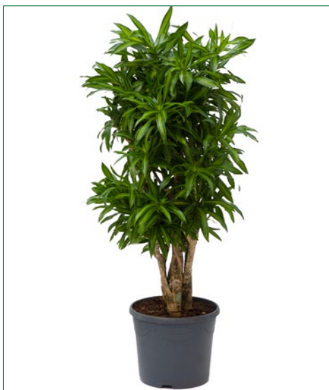
Artcode: 4PLSJT24 Description: Pleomele song of jamaica Variety: Branched (100-120) Pot: 31 Height: 120