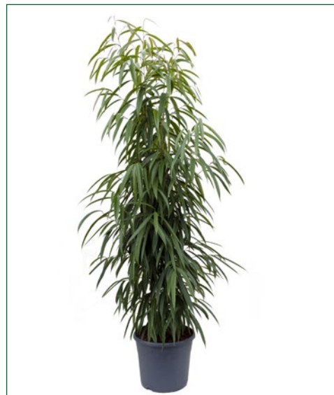
Artcode: 4FIAL1T21 Description: Ficus alii Variety: Tuft (180-200) Pot: 35 Height: 180