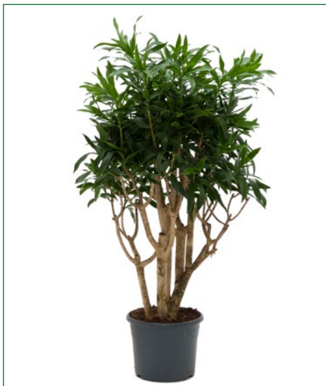
Artcode: 4PLREVT21 Description: Pleomele reflexa Variety: Branched (90-100) Pot: 29 Height: 90