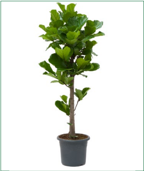
Artcode: 4FILYRS10 Description: Ficus lyrata Variety: Stem (180-200) Pot: 40 Height: 190