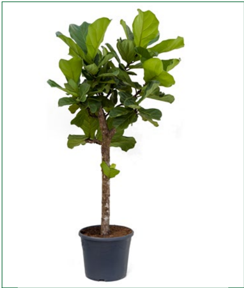
Artcode: 4FILYRS03 Description: Ficus lyrata Variety: Stem Pot: 35 Height: 150