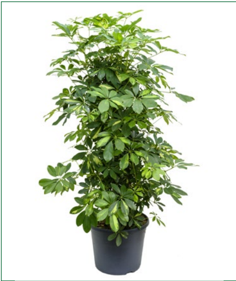
Artcode: 4SCGCS48 Description: Schefflera gold capella Variety: Branched/column Pot: 35 Height: 150