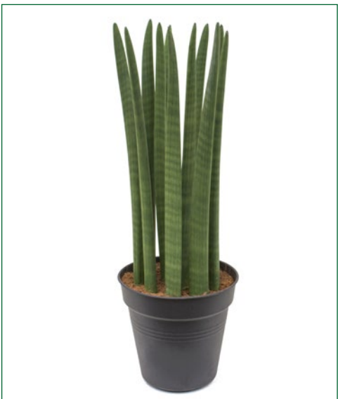
Artcode: 4SACSTU59 Description: Sansevieria straight Variety: Tuft Pot: 27 Height: 80