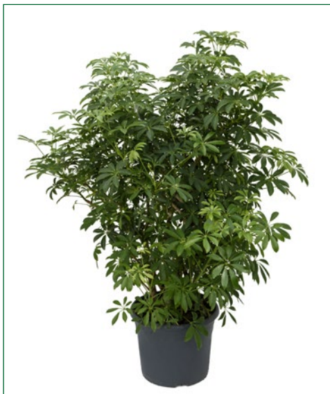
Artcode: 4SCLOVT20 Description: Schefflera louisiana Variety: Branched Pot: 31 Height: 100