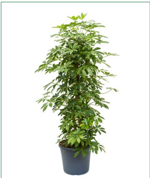
Artcode: 4SCARSS44 Description: Schefflera arboricola Variety: Branched/column Pot: 35 Height: 150