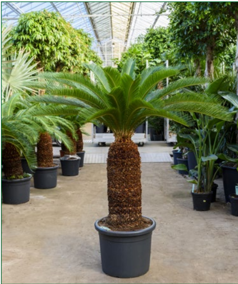
Artcode: 4CYRESS84 Description: Cycas Revoluta Variety: Stem (70) Pot: 45 Height: 170