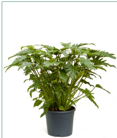
Artcode: 4PHXABU10 Description: Philodendron xanadu Variety: Bush Pot: 31 Height: 80