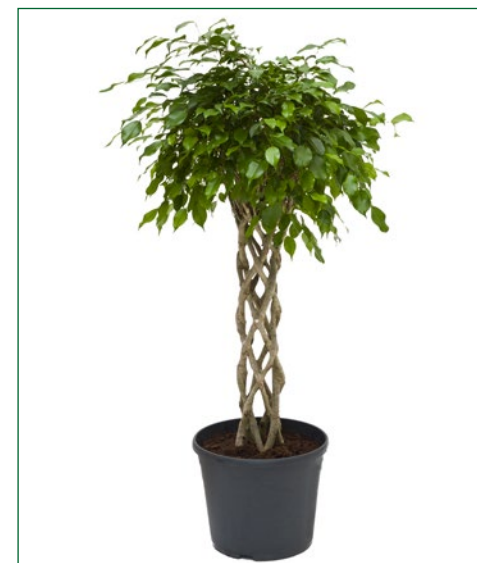
Artcode: 4FIBESS38 Description: Ficus benjamina Variety: Cilinder Pot: 35 Height: 150