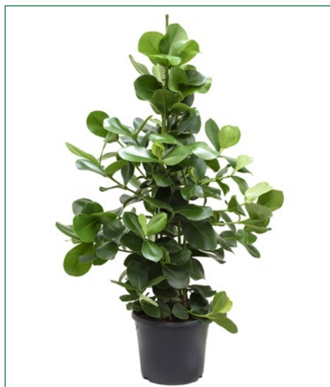
Artcode: 4CLROTU15 Description: Clusia rosea Variety: Tuft Pot: 35 Height: 150