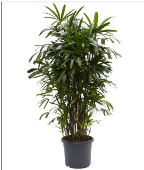
Artcode: 4RHEXBU77 Description: Rhaps excelsa Variety: Tuft (170-190) Pot: 40 Height: 200