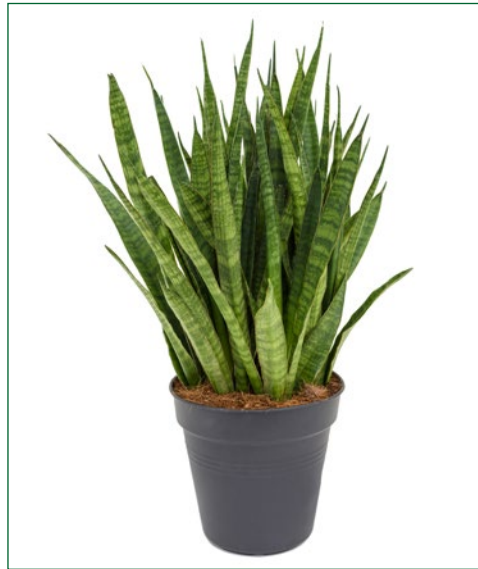
Artcode: 4SAKIBU30 Description: Sansevieria kirkii Variety: Tuft Pot: 21 Height: 70