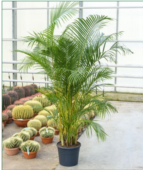
Artcode: 4CHLUBU26 Description: Areca (chrysalidoc.) lutescens Variety: Tuft Pot: 35 Height: 200