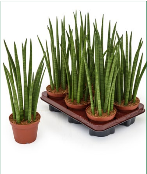
Artcode: 4SASPTU40 Description: Sansevieria spike 6/tray Variety: Tuft Pot: 12 Height: 45