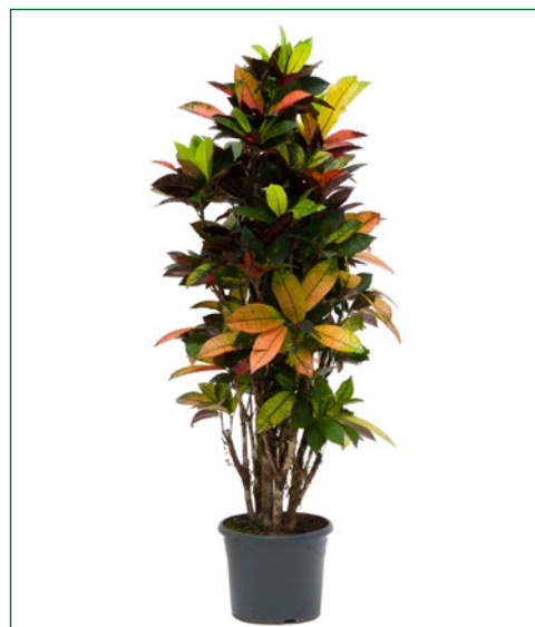
Artcode: 4COICVT48 Description: Croton (codiaeum) iceton Variety: Branched Pot: 31 Height: 150