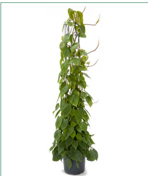
Artcode: 4PHSCZU08 Description: Philodendron scandens Variety: Column Pot: 29 Height: 150