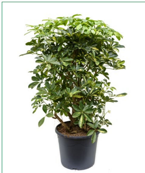
Artcode: 4SCGCVT15 Description: Schefflera gold capelle Variety: Branched Pot: 35 Height: 130