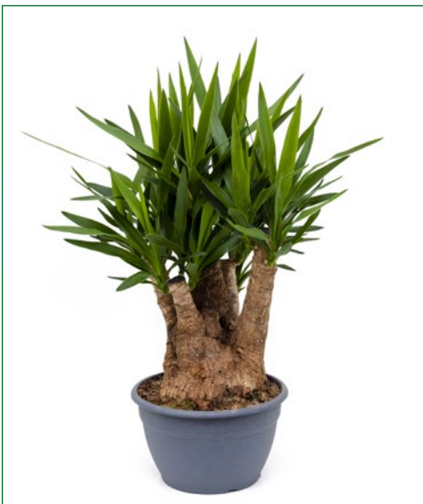
Artcode: 4YUELVT81 Description: Yucca elephantipes Variety: Branched Pot: 30 Height: 100