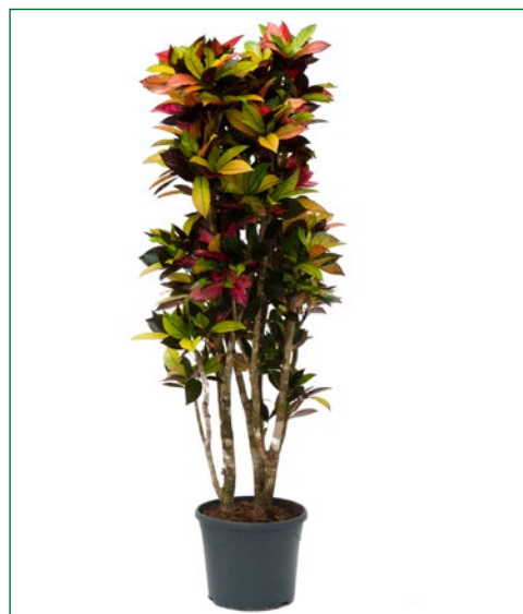
Artcode: 4COICVT50 Description: Croton (codiaeum) iceton Variety: Branched Pot: 35 Height: 170