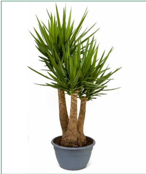
Artcode: 4YUELVT85 Description: Yucca elephantipes Variety: Branched Pot: 40 Height: 170