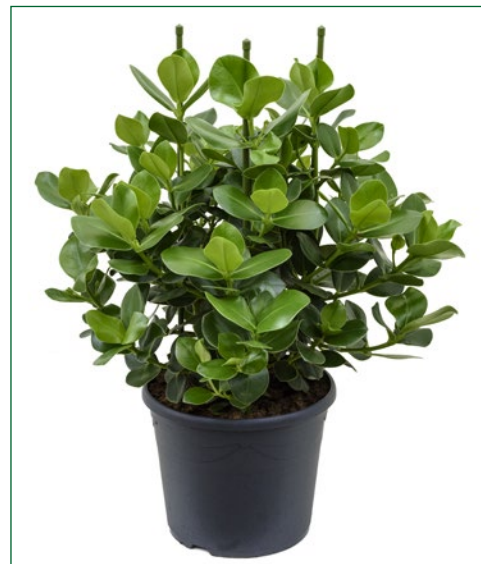
Artcode: 4CLRP3T08 Description: Clusia rosea princess Variety: Bush 3pp Pot: 35 Height: 120