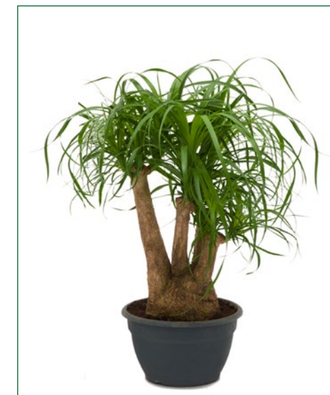
Artcode: 4BEREVT08 Description: Beaucarnea recurvata Variety: Branched (40) saucer ø20 Pot: 25 Height: 80