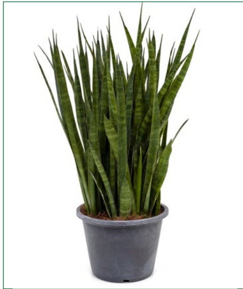
Artcode: 4SAKIBU35 Description: Sansevieria kirkii Variety: Tuft Pot: 27 Height: 70