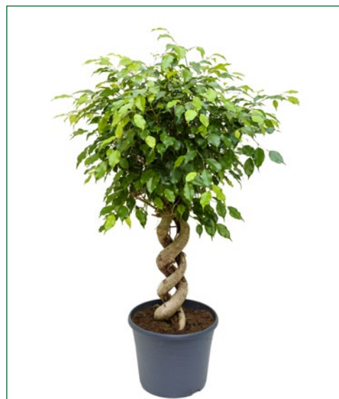
Artcode: 4FIBE2S05 Description: Ficus benjamina Variety: Spiral double Pot: 35 Height: 140