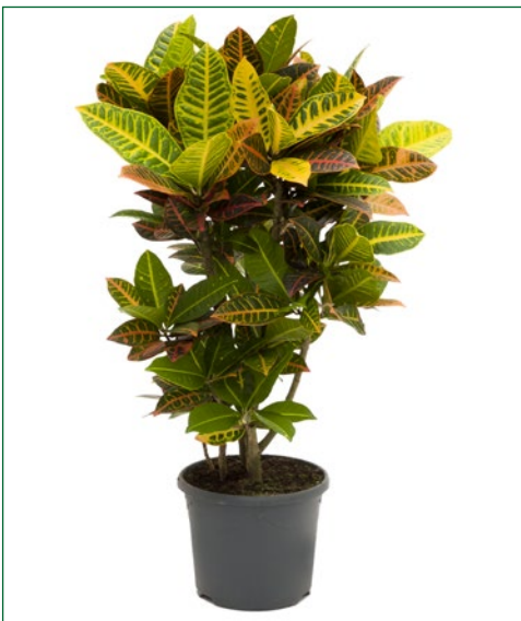
Artcode: 4COPEVT13 Description: Croton (codiaeum) Petra Variety: Branched Pot: 29 Height: 110