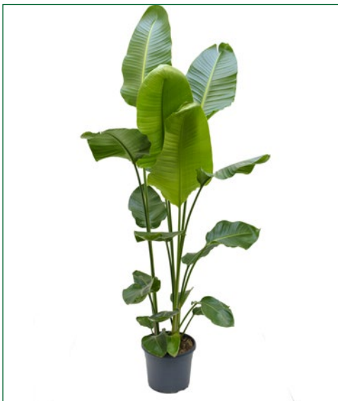
Artcode: 4STNITU27 Description: Strelitzia nicolai Variety: Tuft Pot: 29 Height: 175