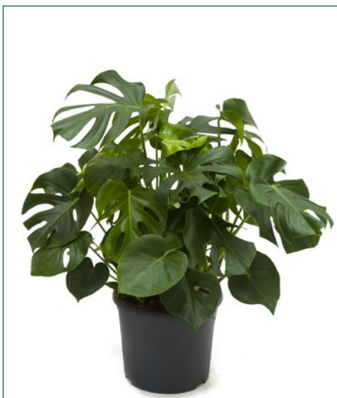
Artcode: 4PHPEBU08 Description: Philodendron pertusum (monstera) Variety: Tuft Pot: 31 Height: 85