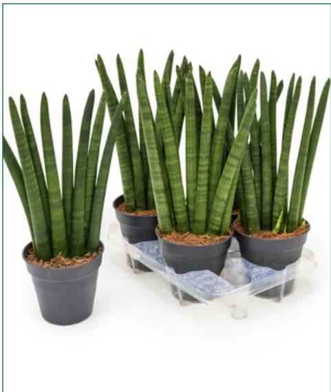
Artcode: 4SACWTU01 Description: Sansevieria wave 4/tray Variety: Tuft Pot: 15 Height: 45