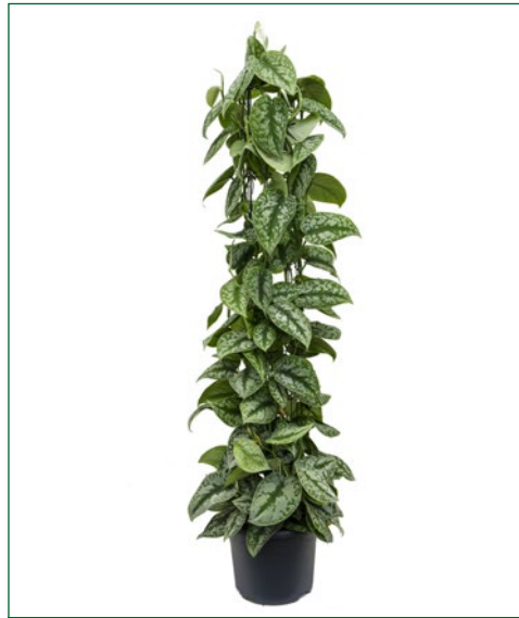
Artcode: 4SCPTZU13 Description: Scindapsus pictus trebie Variety: Column Pot: 26 Height: 120