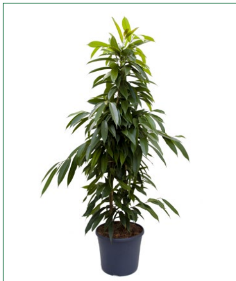
Artcode: 4FIAK1T18 Description: Ficus amstel king Variety: Tuft Pot: 35 Height: 150