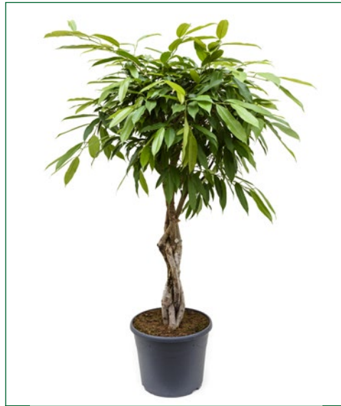
Artcode: 4FIAKGS04 Description: Ficus amstel king Variety: Stem braided Pot: 35 Height: 140