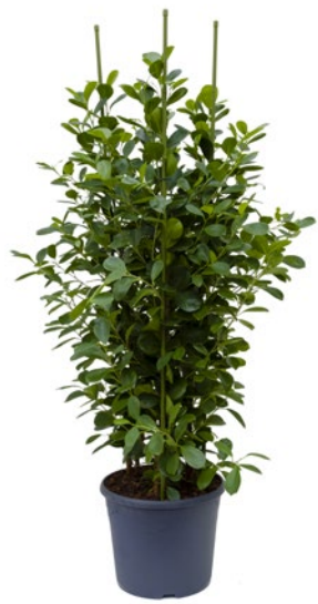
Artcode: 4FIM03T05 Description: Ficus molclame Variety: Tuft (140-160) Pot: 35 Height: 150