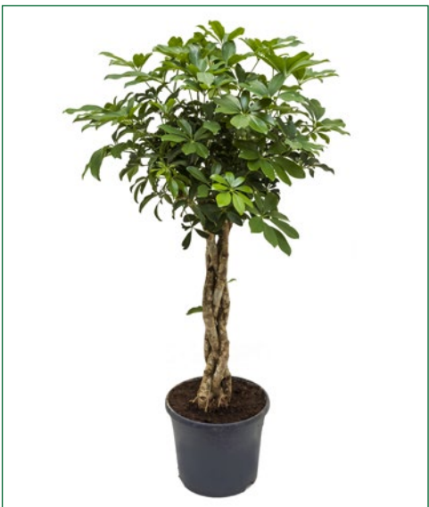
Artcode: 4SCARGS25 Description: Schefflera arboricola Variety: Stem braided Pot: 31 Height: 120