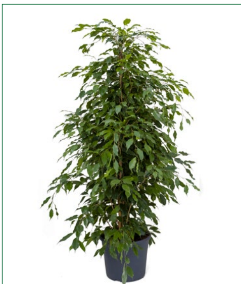
Artcode: 4FIBE1T18 Description: Ficus benjamina Variety: Tuft Pot: 35 Height: 150