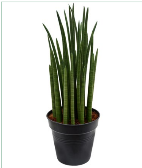
Artcode: 4SACYTU16 Description: Sansevieria tower Variety: Tuft Pot: 35 Height: 100