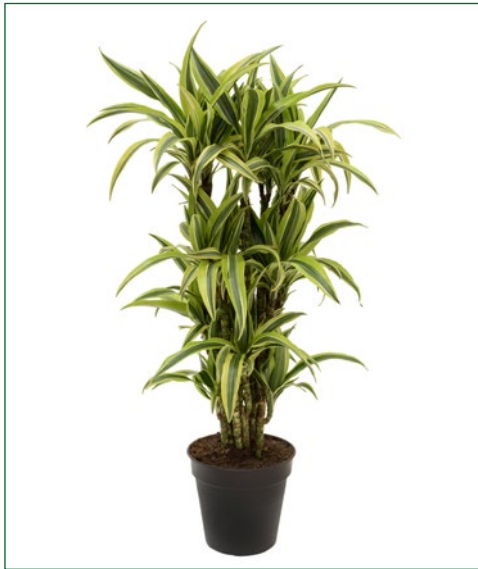
Artcode: 4DRLLVT18 Description: Dracaena Lemon Lime Variety: Branched-multi Pot: 24 Height: 110