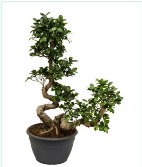
Artcode: 4FIMIHA08 Description: Ficus microcarpa compacta Variety: S-stem+cascade Pot: 35 Height: 110