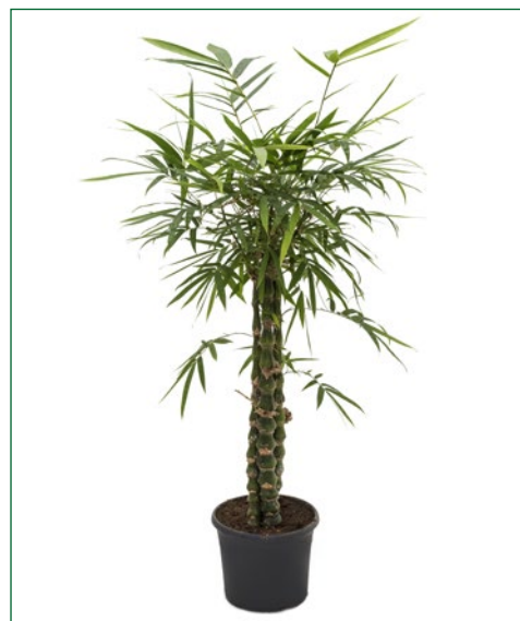
Artcode: 4BAVEBU10 Description: Bambusa ventricosa Variety: Bush Pot: 29 Height: 140