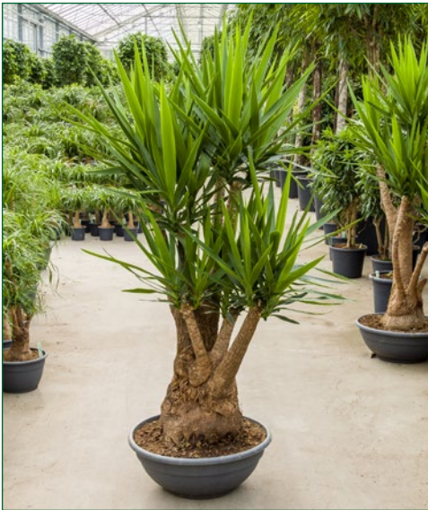
Artcode: 4YUELVT76 Description: Yucca elephantipes Variety: Branched Pot: 60 Height: 200