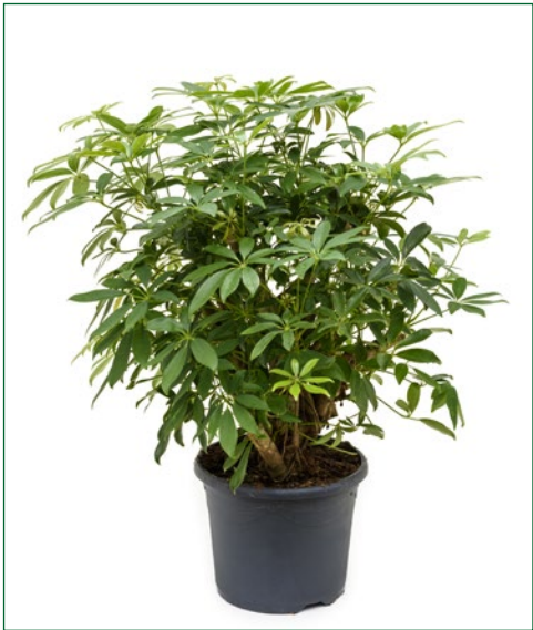
Artcode: 4SCARVT08 Description: Schefflera arboricola Variety: Branched Pot: 26 Height: 100