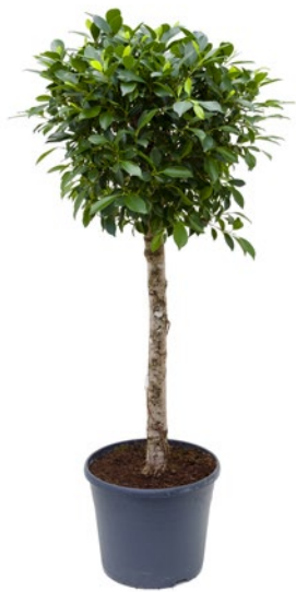
Artcode: 4FINIRS44 Description: Ficus nitida Variety: Stem Pot: 35 Height: 140