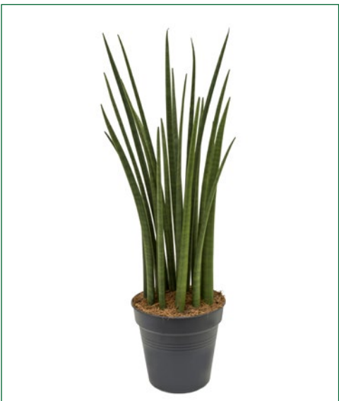
Artcode: 4SASPTU15 Description: Sansevieria spikes Variety: Tuft Pot: 19 Height: 70