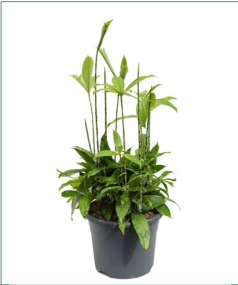
Artcode: 4DRSUBU31 Description: Dracaena Surculosa Variety: Bush Pot: 26 Height: 85