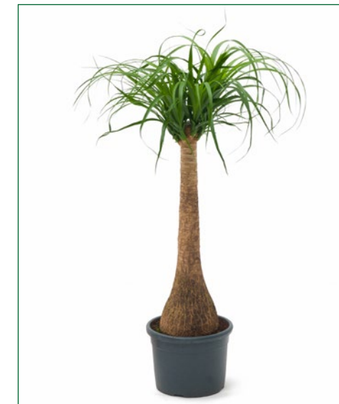
Artcode: 4BERERS46 Description: Beaucarnea recurvata Variety: Stem (60) Pot: 22+ Height: 110