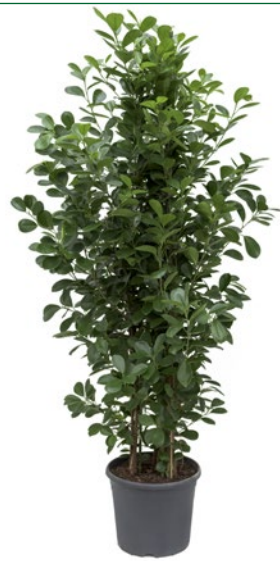
Artcode: 4FIM03T08 Description: Ficus molclame Variety: Tuft Pot: 35 Height: 180