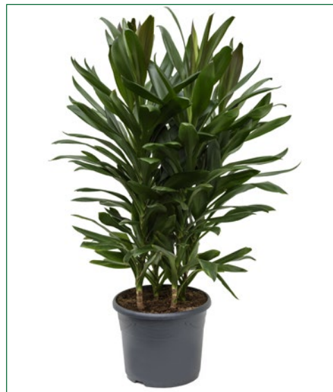
Artcode: 4COGLTU25 Description: Cordyline glauca Variety: Tuft 4pp Pot: 26 Height: 60