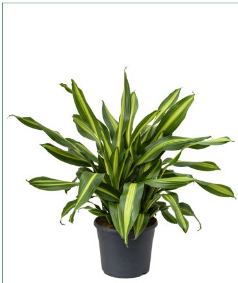
Artcode: 4DRBUK025 Description: Dracaena Burley Variety: Head 3pp Pot: 35 Height: 90