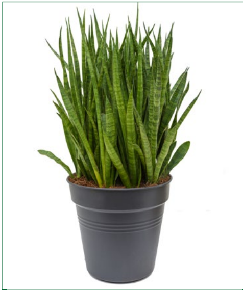
Artcode: 4SAKIBU40 Description: Sansevieria kirkii Variety: Tuft Pot: 35 Height: 80