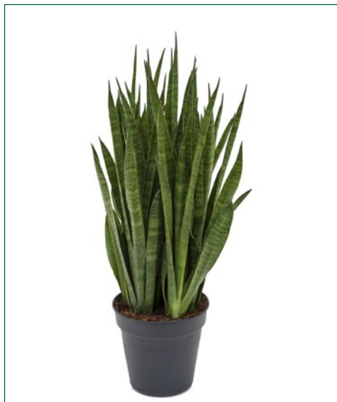
Artcode: 4SAKIBU28 Description: Sansevieria kirkii Variety: Tuft Pot: 17 Height: 55