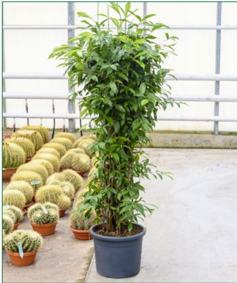
Artcode: 4DRSUBU41 Description: Dracaena surculosa Variety: Bush Pot: 40 Height: 220