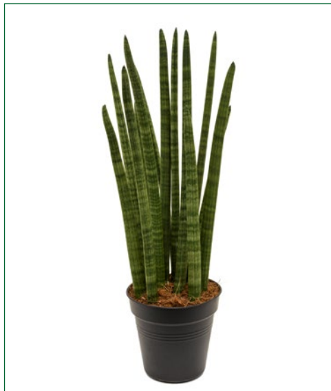
Artcode: 4SACYTU17 Description: Sansevieria tower Variety: Tuft Pot: 17 Height: 60