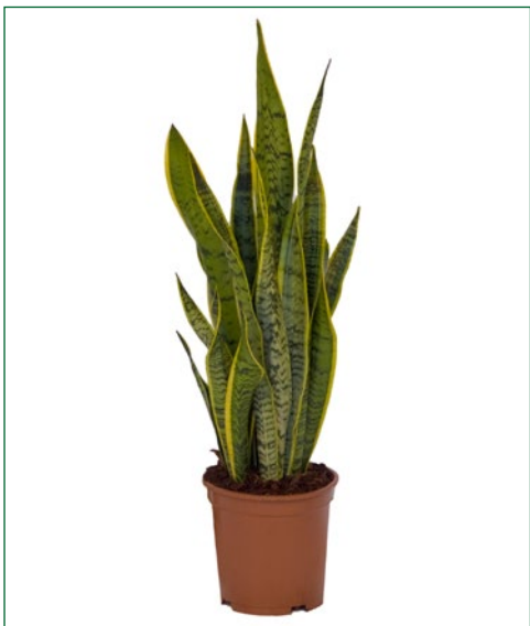
Artcode: 4SALATU40 Description: Sansevieria laurentii Variety: Tuft Pot: 21 Height: 50