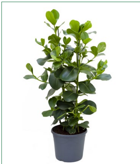
Artcode: 4CLROTU10 Description: Clusia rosea Variety: Tuft Pot: 35 Height: 120