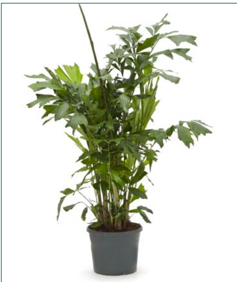
Artcode: 4CAMIBU13 Description: Caryota mitis Variety: Tuft Pot: 29 Height: 140