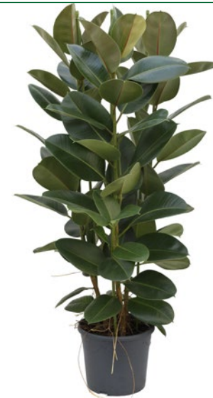
Artcode: 4FIRO3T15 Description: Ficus robusta Variety: Tuft Pot: 31 Height: 150