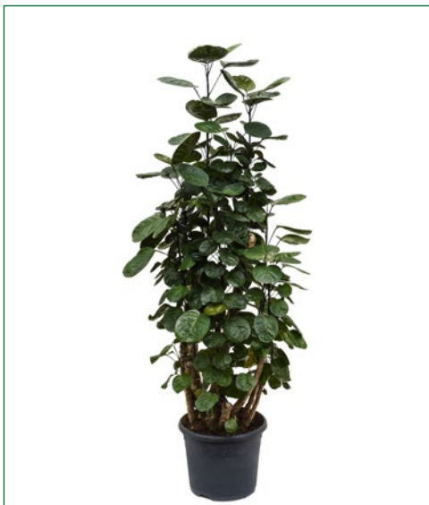
Artcode: 4POFAVT41 Description: Aralia (polyscias) fabian Variety: Branched (90-100) Pot: 26 Height: 110