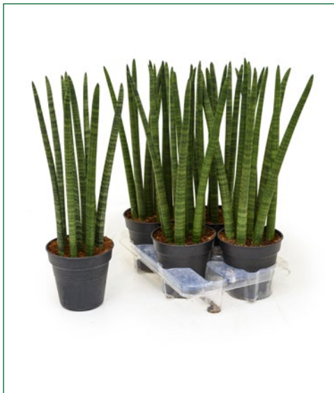
Artcode: 4SACSTU49 Description: Sansevieria straight 4/tray Variety: Tuft Pot: 15 Height: 50