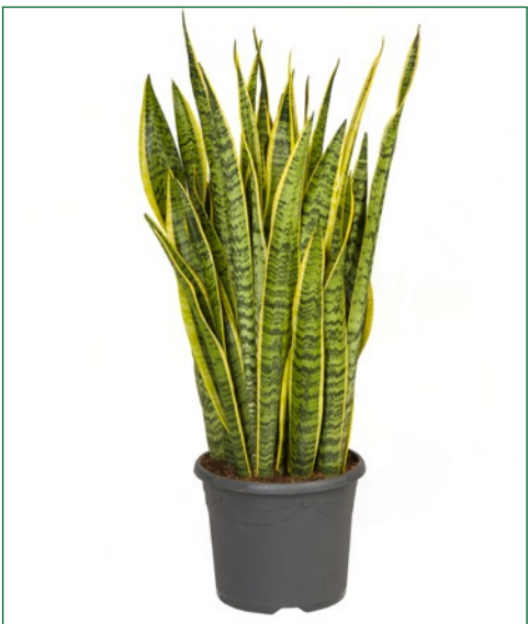
Artcode: 4SALATU05 Description: Sansevieria laurentii Variety: Tuft Pot: 26 Height: 60