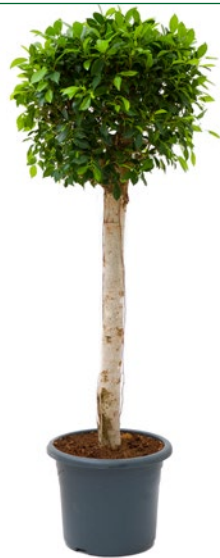
Artcode: 4FINIRS11 Description: Ficus nitida Variety: Stem Pot: 40 Height: 180