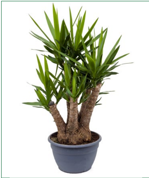
Artcode: 4YUELVT83 Description: Yucca elephantipes Variety: Branched Pot: 35 Height: 130