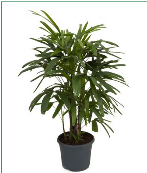
Artcode: 4RHEXBU68 Description: Rhaps excelsa Variety: Tuft Pot: 26 Height: 100