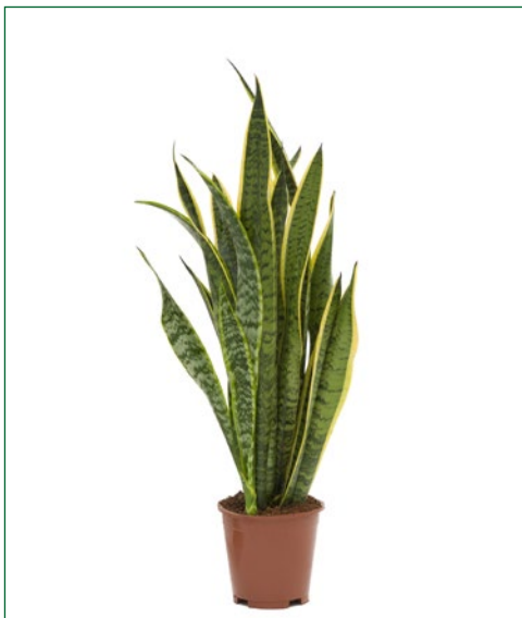
Artcode: 4SALATU55 Description: Sansevieria laurentii Variety: Tuft Pot: 17 Height: 45