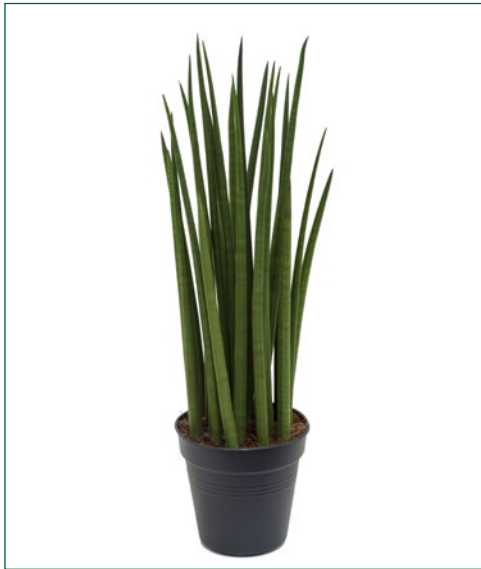
Artcode: 4SASPTU19 Description: Sansevieria spikes Variety: Tuft Pot: 21 Height: 80