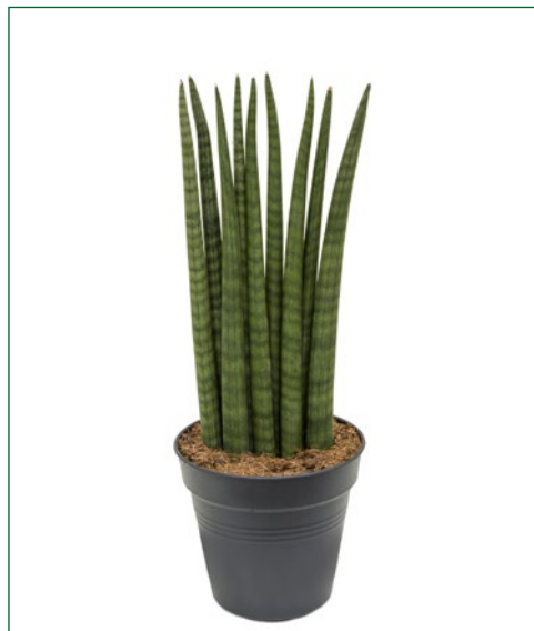
Artcode: 4SACWTU03 Description: Sansevieria wave Variety: Tuft Pot: 19 Height: 50