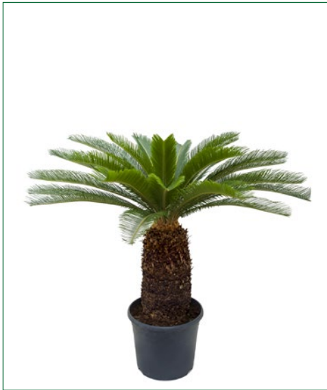
Artcode: 4CYRESS50 Description: Cycas Revoluta Variety: Stem (50) Pot: 35 Height: 110