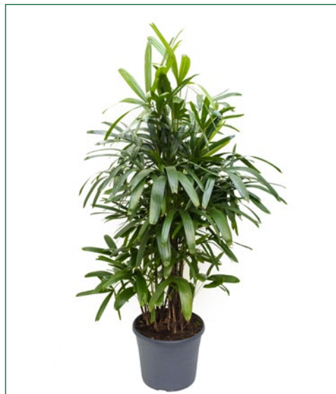
Artcode: 4RHEXBU71 Description: Rhaps excelsa Variety: Tuft (140-160) Pot: 35 Height: 160