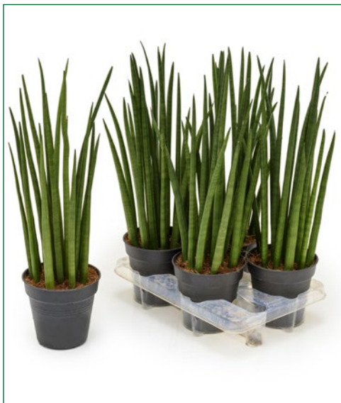
Artcode: 4SASPTU12 Description: Sansevieria spikes 4/tray Variety: Tuft Pot: 15 Height: 60