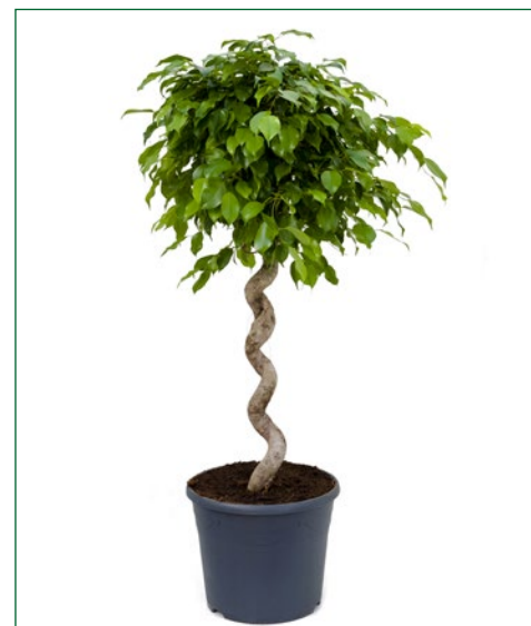
Artcode: 4FIBESS06 Description: Ficus benjamina Variety: Spiral Pot: 35 Height: 150