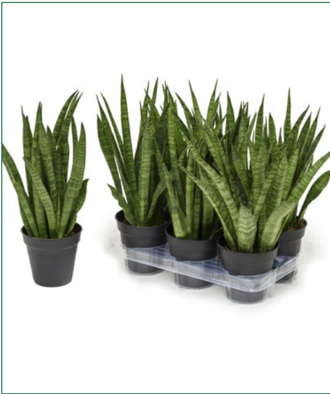
Artcode: 4SAKIBU11 Description: Sansevieria kirkii 6/tray 206 Variety: - Pot: 13 Height: 40