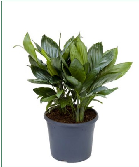
Artcode: 4CHMEBU15 Description: Chamaedorea metalica Variety: Bush Pot: 29 Height: 40