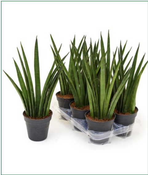
Artcode: 4SANATU15 Description: Sansevieria natcha 6/tray Variety: Tuft Pot: 13 Height: 40