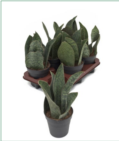
Artcode: 4SAGOTU02 Description: Sansevieria masiona gongo 6/tray Variety: Tuft Pot: 13 Height: 30