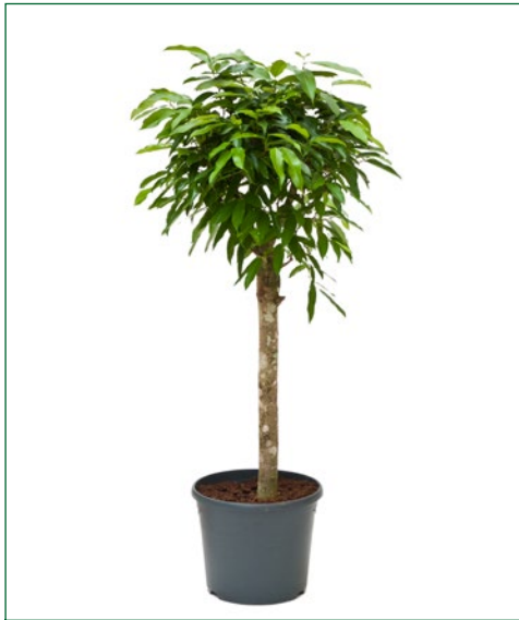
Artcode: 4FIAKRS33 Description: Ficus amstel king Variety: Stem Pot: 35 Height: 150