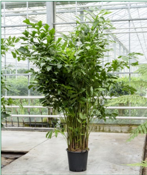
Artcode: 4CAMIBU37 Description: Caryota mitis Variety: Bush (275-300) Pot: 45 Height: 275