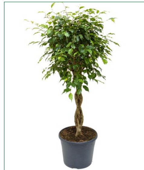
Artcode: 4FIBEGS12 Description: Ficus benjamina Variety: Stem braided Pot: 35 Height: 150