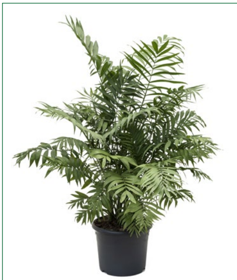
Artcode: 4CHELTU29 Description: Chamaedorea elegans Variety: Tuft Pot: 29 Height: 100