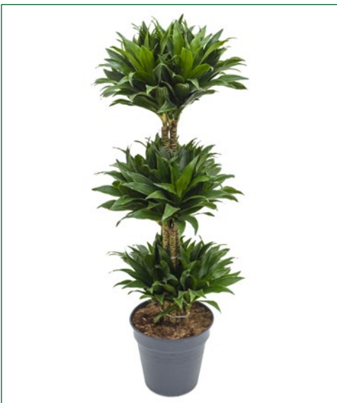
Artcode: 4DRCOBA09 Description: Dracaena Compacta Variety: 90-Ballerina Pot: 31 Height: 140