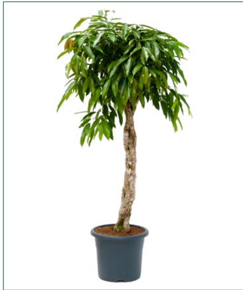
Artcode: 4FIAKGS07 Description: Ficus amstel king Variety: Stem braided Pot: 40 Height: 180