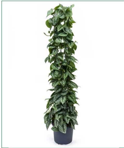
Artcode: 4SCPTZU18 Description: Scindapsus pictus trebie Variety: Column Pot: 29 Height: 150