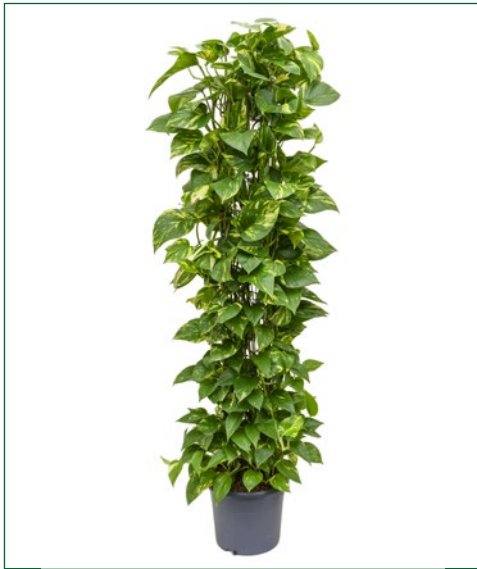
Artcode: 4SCAUZU08 Description: Scindapsus (epipremnum) aureum Variety: Column Pot: 29 Height: 150