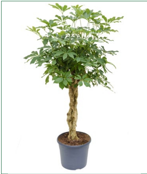
Artcode: 4SCARGS18 Description: Schefflera arboricola Variety: Stem braided Pot: 31 Height: 130