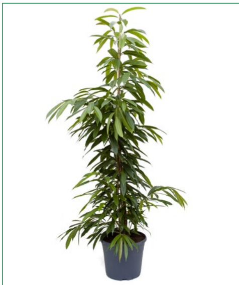
Artcode: 4FIAK1T21 Description: Ficus amstel king Variety: Tuft Pot: 35 Height: 180