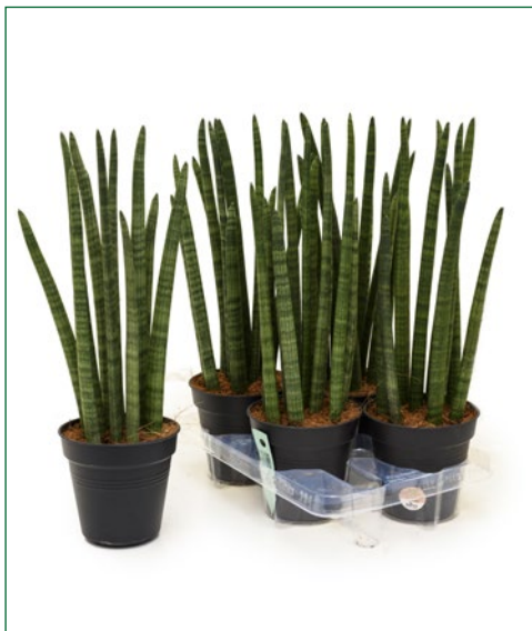
Artcode: 4SACYTU07 Description: Sansevieria tower 4/tray Variety: Tuft Pot: 15 Height: 50