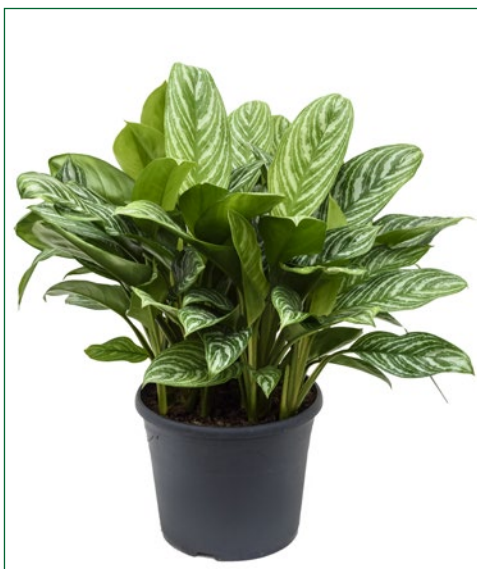
Artcode: 4AGSTBU27 Description: Aglaonema stripes Variety: Bush Pot: 35 Height: 80