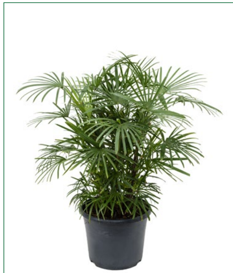
Artcode: 4RHHUBU15 Description: Rhaps humilis Variety: Bush Pot: 29 Height: 80