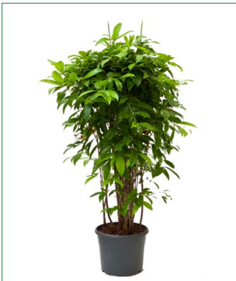
Artcode: 4DRSUBU34 Description: Dracaena surculosa Variety: Bush Pot: 31 Height: 130