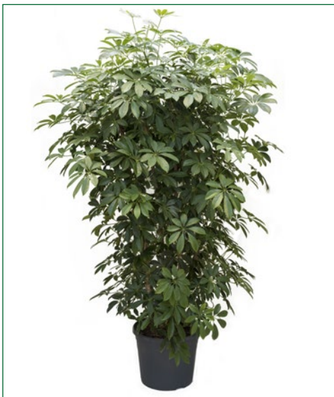
Artcode: 4SCARVT35 Description: Schefflera arboricola Variety: Branched Pot: 35 Height: 130