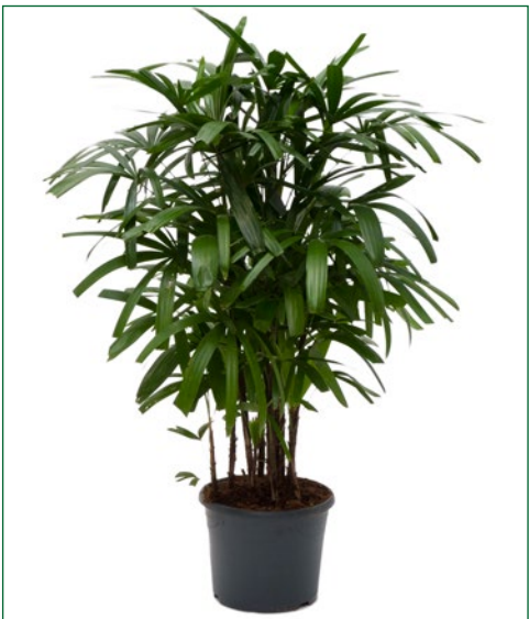
Artcode: 4RHEXBU69 Description: Rhaps excelsa Variety: Tuft (120-130) Pot: 31 Height: 140