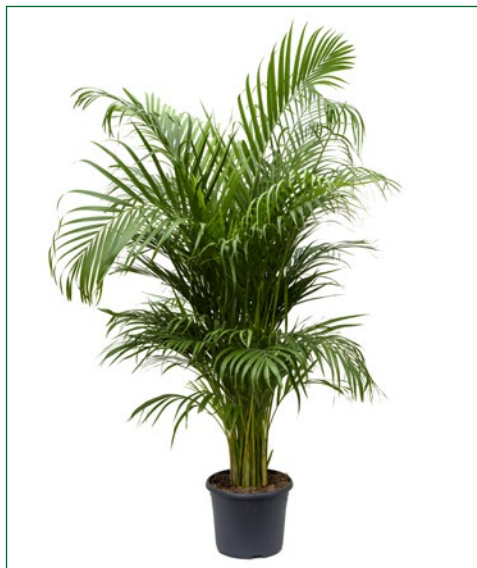
Artcode: 4CHLUBU06 Description: Areca (chrysalidoc.) lutescens Variety: Tuft Pot: 26 Height: 140