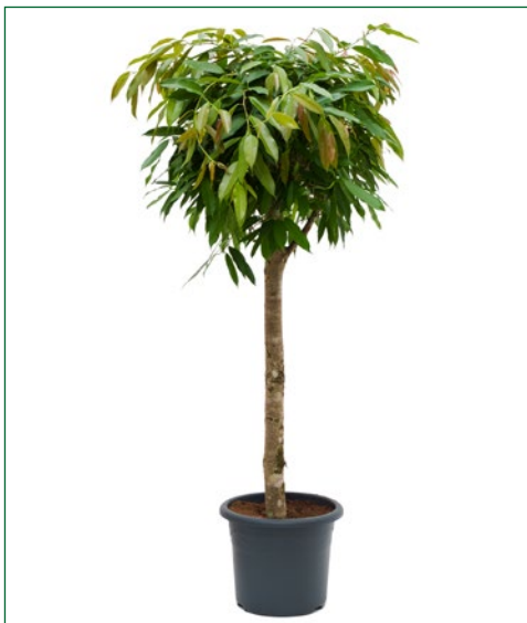
Artcode: 4FIAKRS35 Description: Ficus amstel king Variety: Stem Pot: 40 Height: 180