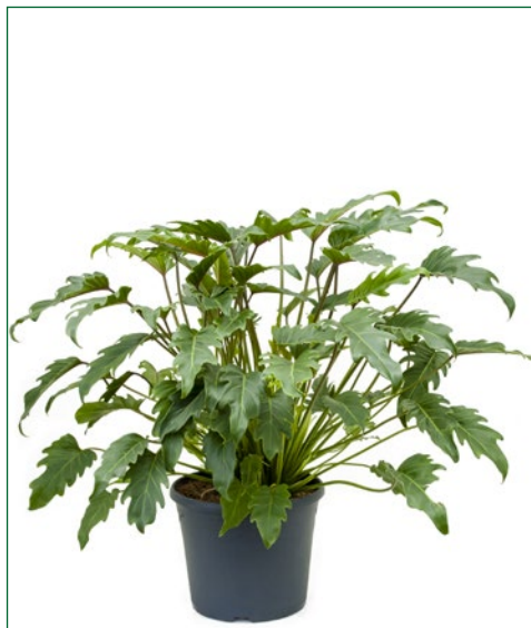
Artcode: 4PHXABU11 Description: Philodendron xanadu Variety: Bush Pot: 35 Height: 80