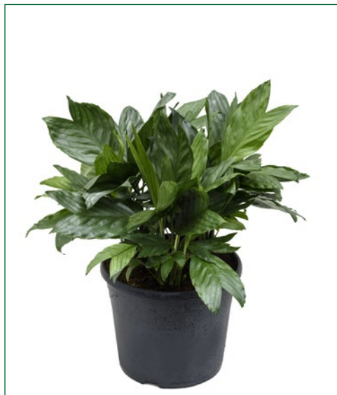
Artcode: 4CHMEBU20 Description: Chamaedorea metalica Variety: Bush Pot: 35 Height: 40