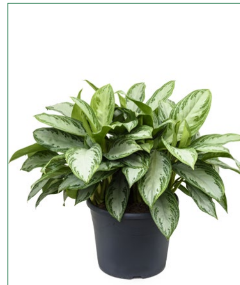
Artcode: 4AGSBBU22 Description: Aglaonema silver bay Variety: Tuft Pot: 35 Height: 70