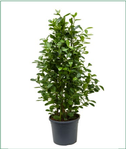
Artcode: 4FIMO3T03 Description: Ficus moclame Variety: Tuft Pot: 31 Height: 120