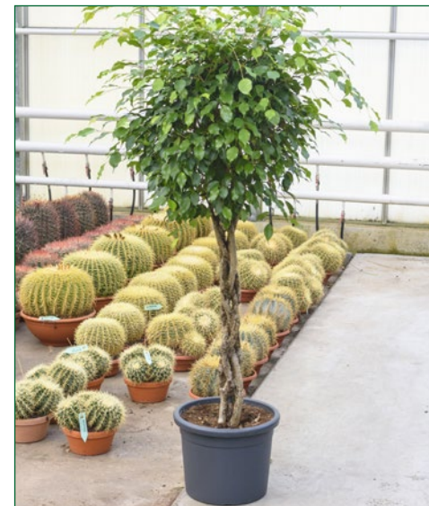
Artcode: 4FIBEGS14 Description: Ficus benjamina Variety: Stem braided Pot: 40 Height: 175