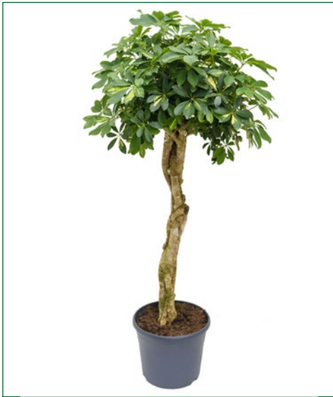
Artcode: 4SCGGS31 Description: Schefflera gold capella Variety: Stem braided Pot: 35 Height: 160