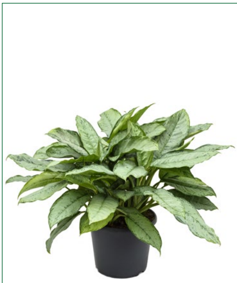
Artcode: 4AGFRBU15 Description: Aglaonema freedman Variety: Tuft Pot: 35 Height: 80