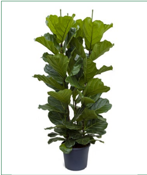
Artcode: 4FILY3T18 Description: Ficus lyrata Variety: Tuft Pot: 35 Height: 180