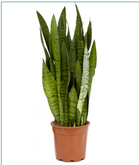
Artcode: 4SAZETU08 Description: Sansevieria zeylanica Variety: Tuft Pot: 21 Height: 70