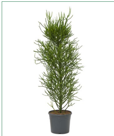
Artcode: 4EUTIKK17 Description: Euphorbia tirucalli Variety: Bush Pot: 31 Height: 160