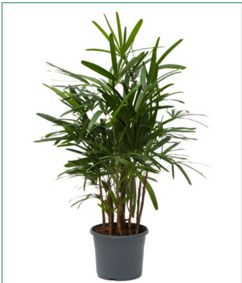
Artcode: 4RHEXBU66 Description: Rhaps excelsa Variety: Tuft Pot: 29 Height: 110