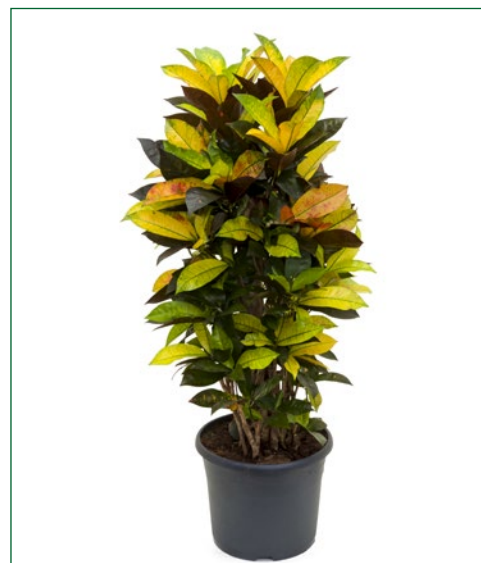
Artcode: 4COICVT44 Description: Croton (codiaeum) iceton Variety: Branched Pot: 29 Height: 110