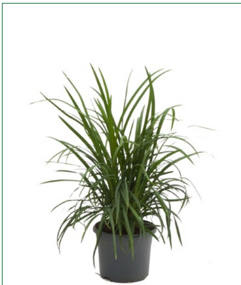
Artcode: 40PJABU14 Description: Ophiopogon japonica Variety: Bush Pot: 19 Height: 30