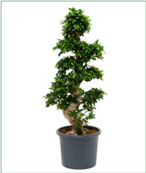
Artcode: 4FIMISS05 Description: Ficus microcarpa compacta Variety: S-stem Pot: 50 Height: 190