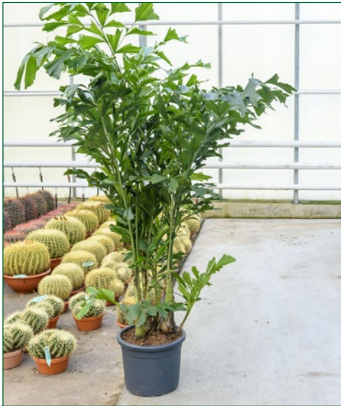
Artcode: 4CAMIBU28 Description: Caryota mitis Variety: Bush Pot: 40 Height: 200