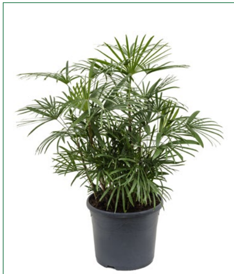
Artcode: 4RHHUBU20 Description: Rhaps humilis Variety: Bush Pot: 31 Height: 110