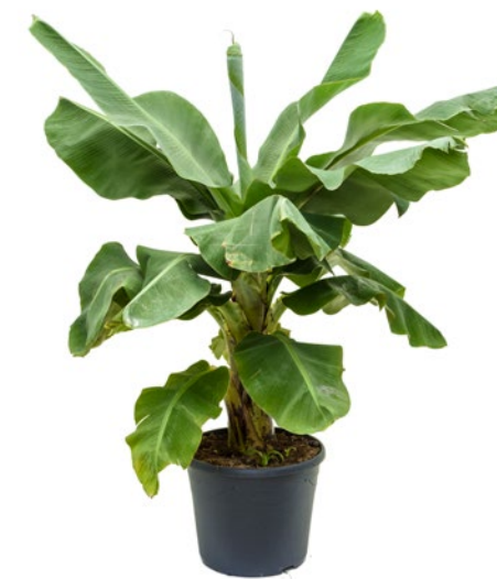
Artcode: 4MUDCRS20 Description: Musa dwarf cavendish Variety: Stem Pot: 35 Height: 120