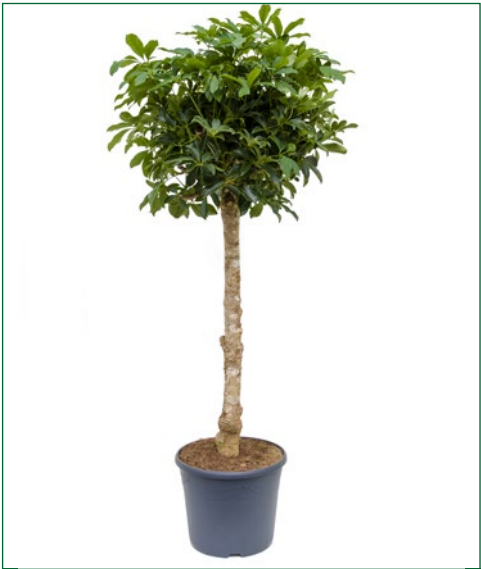
Artcode: 4SCARRS10 Description: Schefflera arboricola Variety: Stem Pot: 35 Height: 160