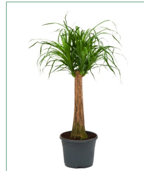
Artcode: 4BERERS43 Description: Beaucarnea recurvata Variety: Stem (40) Pot: 22 Height: 80