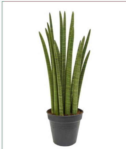
Artcode: 4SACYTU04 Description: Sansevieria tower Variety: Tuft Pot: 19 Height: 60