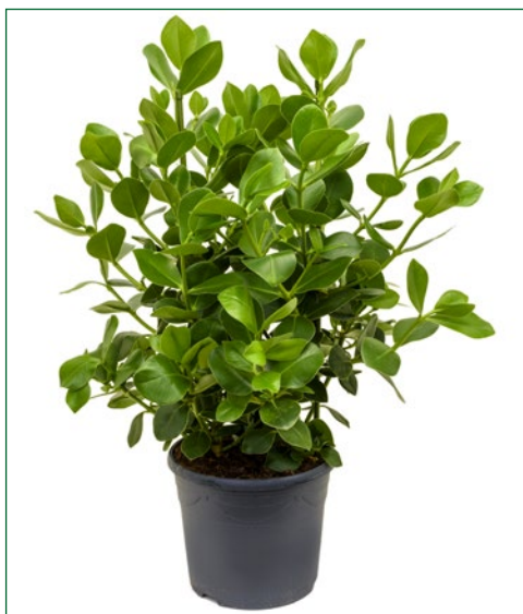
Artcode: 4CLRP2T05 Description: Clusia rosea princess Variety: Bush 2pp Pot: 31 Height: 100