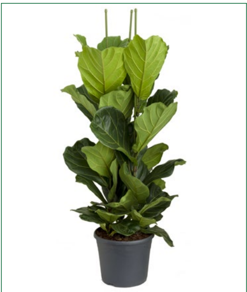
Artcode: 4FILY3T10 Description: Ficus lyrata Variety: Tuft Pot: 35 Height: 150