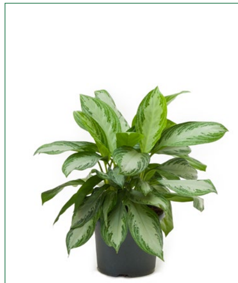
Artcode: 4AGSBBU20 Description: Aglaonema silver bay Variety: Tuft Pot: 26 Height: 40