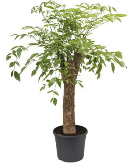
Artcode: 4HECHVT06 Description: Heteropanax chinensis Variety: Branched Pot: 35 Height: 140