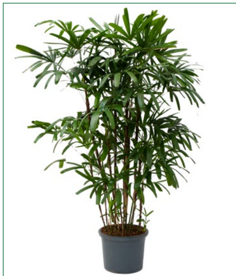
Artcode: 4RHEXBU81 Description: Rhaps excelsa Variety: Tuft (190-220) Pot: 45 Height: 190