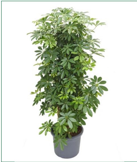
Artcode: 4SCARSS52 Description: Schefflera arboricola Variety: Branched/column Pot: 45 Height: 180