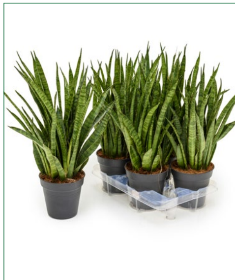
Artcode: 4SAKIBU25 Description: Sansevieria kirkii 4/tray Variety: Tuft Pot: 15 Height: 50