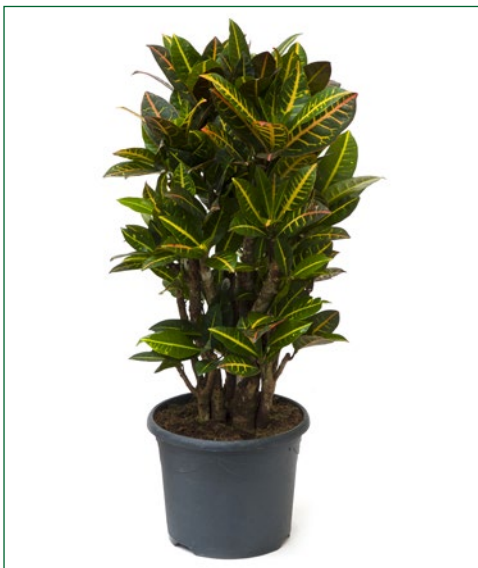
Artcode: 4COPEVT03 Description: Croton (codiaeum) Petra Variety: Branched Pot: 26 Height: 80