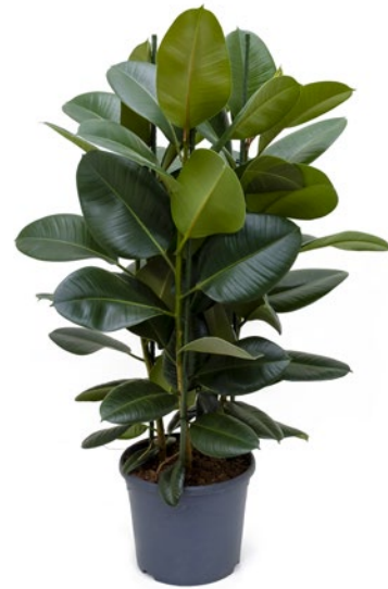
Artcode: 4FIRO3T11 Description: Ficus robusta Variety: Tuft Pot: 31 Height: 120