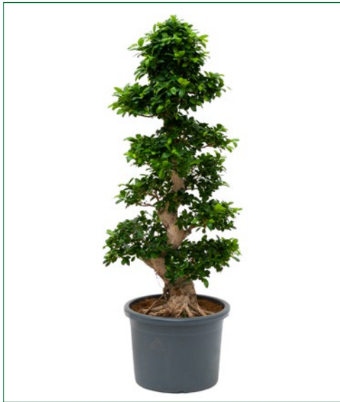
Artcode: 4FIMISS06 Description: Ficus microcarpa compacta Variety: S-Stem Pot: 45 Height: 180