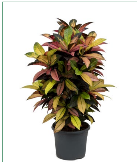
Artcode: 4COICVT08 Description: Croton (codiaeum) iceton Variety: Branched Pot: 26 Height: 90