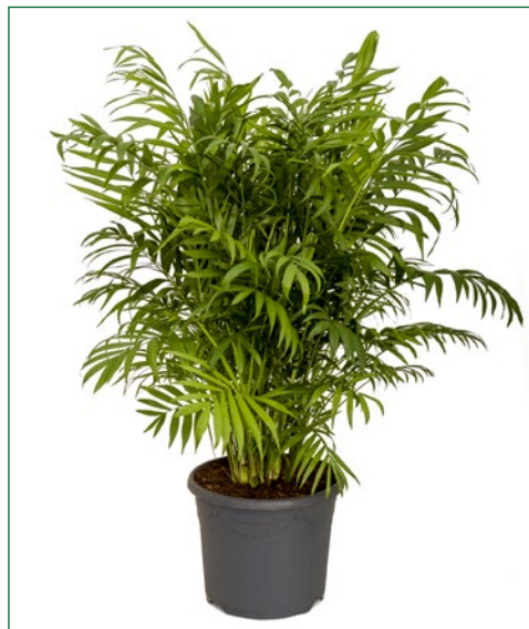
Artcode: 4CHELTU25 Description: Chamaedorea elegans Variety: Tuft Pot: 26 Height: 60