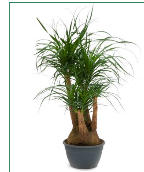
Artcode: 4BEREVT29 Description: Beaucarnea recurvata Variety: Branched (60) saucer ø25 Pot: 30 Height: 100