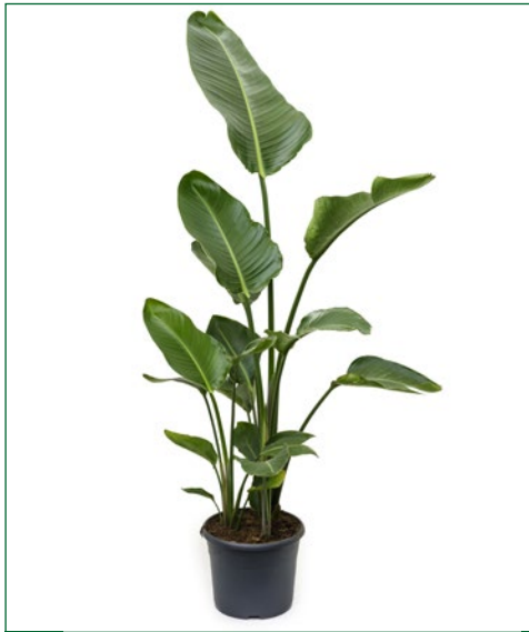
Artcode: 4STNITU12 Description: Strelitzia nicolai Variety: Tuft Pot: 29 Height: 150