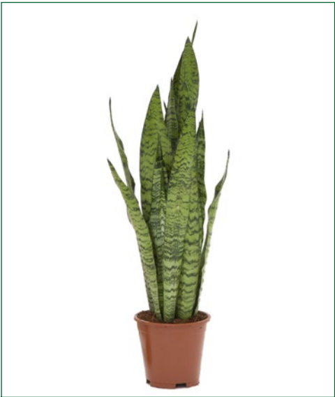
Artcode: 4SAZETU06 Description: Sansevieria zeylanica Variety: Tuft Pot: 17 Height: 50