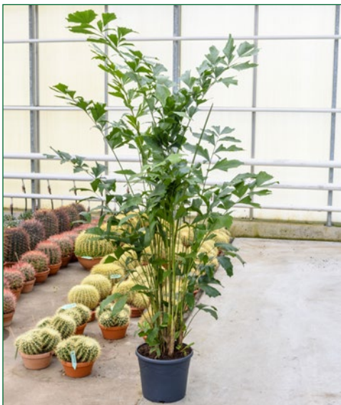
Artcode: 4CAMIBU05 Description: Caryota mitis Variety: Bush Pot: 35 Height: 180