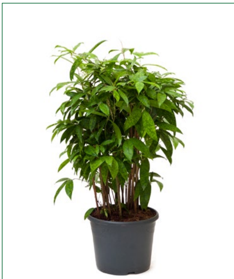
Artcode: 4DRSUBU44 Description: Dracaena surculosa Variety: Bush (90-100) Pot: 29 Height: 110