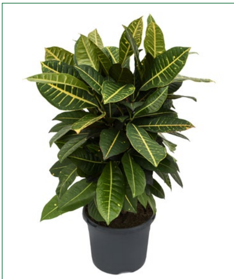
Artcode: 4COPEVT09 Description: Croton (codiaeum) Petra Variety: Branched Pot: 21 Height: 70