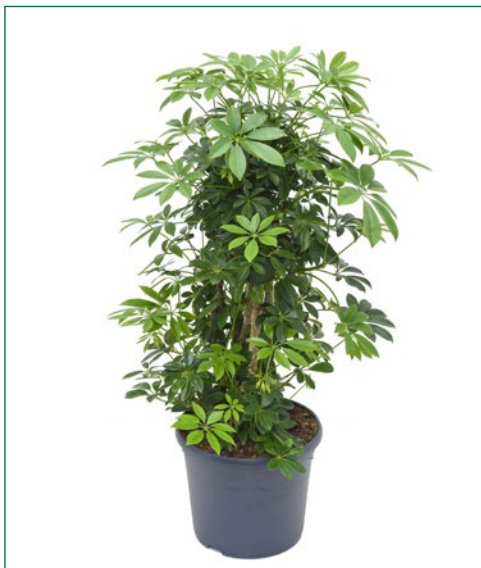
Artcode: 4SCARSS40 Description: Schefflera arboricola Variety: Branched/column Pot: 31 Height: 120