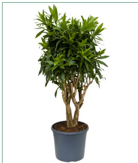
Artcode: 4PLREVT24 Description: Pleomele reflexa Variety: Branched Pot: 31 Height: 110