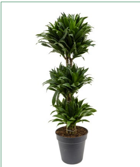
Artcode: 4DRCOBA06 Description: Dracaena Compacta Variety: 60-Ballerina Pot: 24 Height: 80