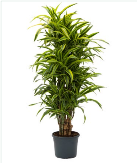
Artcode: 4DRLLVT20 Description: Dracaena Lemon Lime Variety: Branched-multi Pot: 31 Height: 140