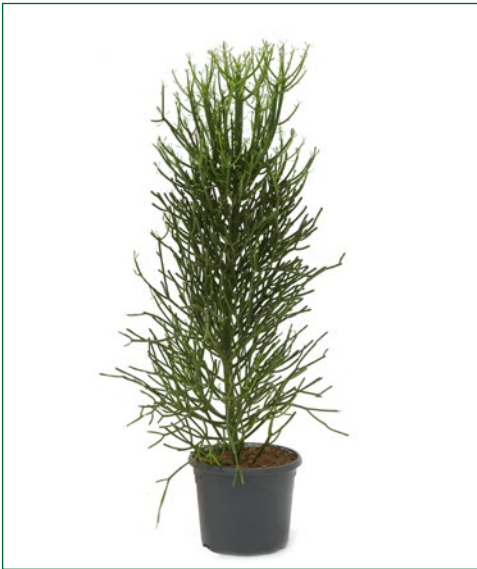
Artcode: 4EUTIKK11 Description: Euphorbia tirucalli Variety: Bush Pot: 29 Height: 150