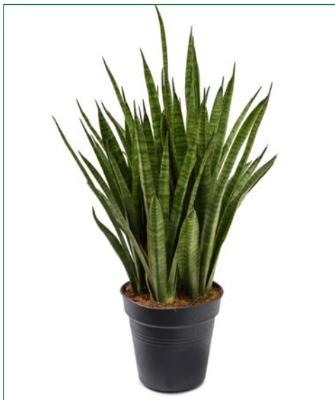
Artcode: 4SAKIBU27 Description: Sansevieria kirkii Variety: Tuft Pot: 19 Height: 55