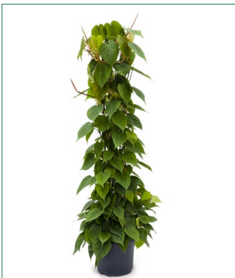
Artcode: 4PHSCZU03 Description: Philodendron scandens Variety: Column Pot: 26 Height: 120