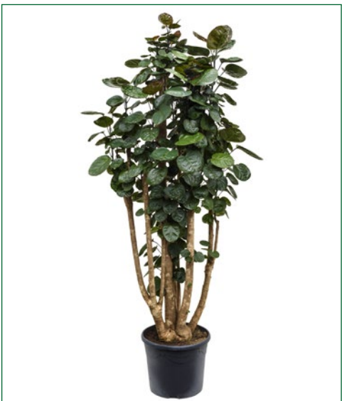
Artcode: 4POFAVT45 Description: Aralia (polyscias) fabian Variety: Branched (150-160) Pot: 31 Height: 170