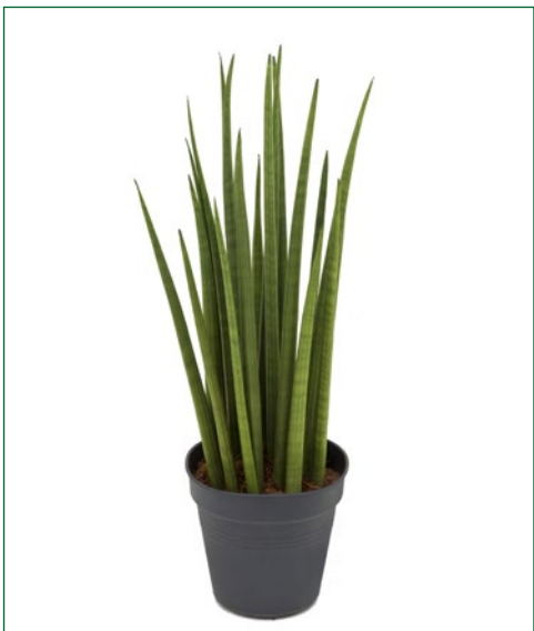
Artcode: 4SASPTU13 Description: Sansevieria spikes Variety: Tuft Pot: 17 Height: 60