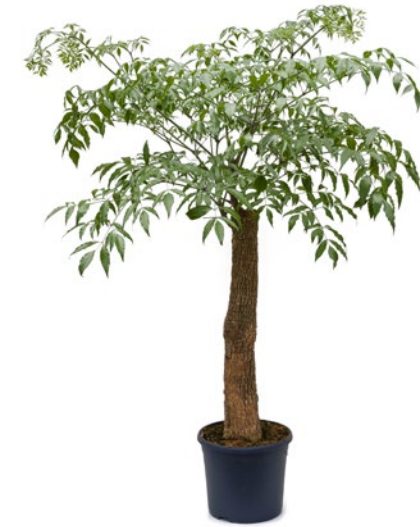
Artcode: 4HECHRS05 Description: Heteropanax chinensis Variety: Stem Pot: 31 Height: 130