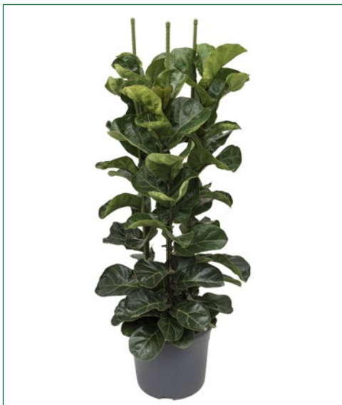
Artcode: 4FILB3T12 Description: Ficus lyrata bambino Variety: Tuft 3pp Pot: 31 Height: 120