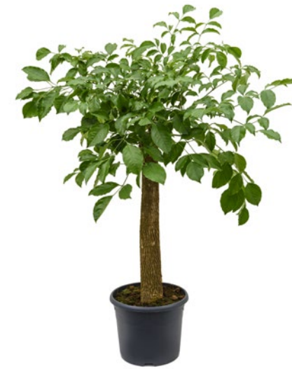
Artcode: 4HECHRS03 Description: Heteropanax chinensis Variety: Stem Pot: 29 Height: 120