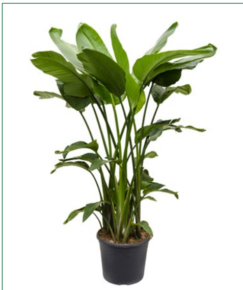
Artcode: 4STNITU14 Description: Strelitzia nicolai Variety: Tuft Pot: 35 Height: 170