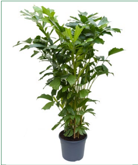
Artcode: 4CAMIBU19 Description: Caryota mitis Variety: Bush Pot: 31 Height: 150