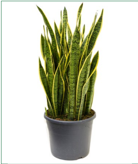
Artcode: 4SALATU35 Description: Sansevieria laurentii Variety: Tuft Pot: 35 Height: 75