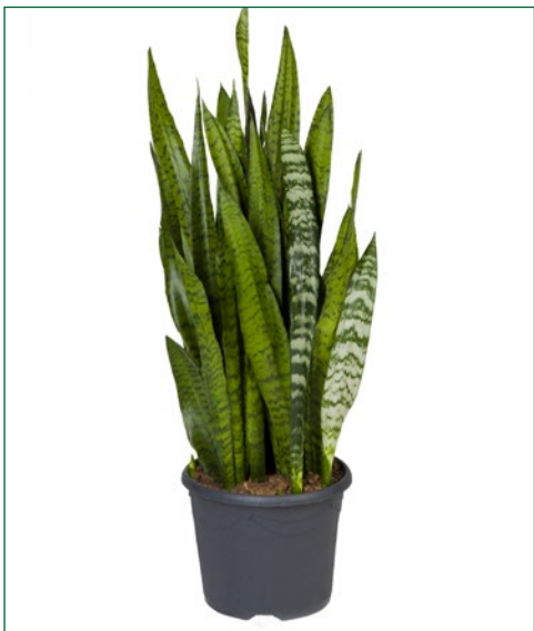
Artcode: 4SAZETU10 Description: Sansevieria zeylanica Variety: Tuft Pot: 26 Height: 70