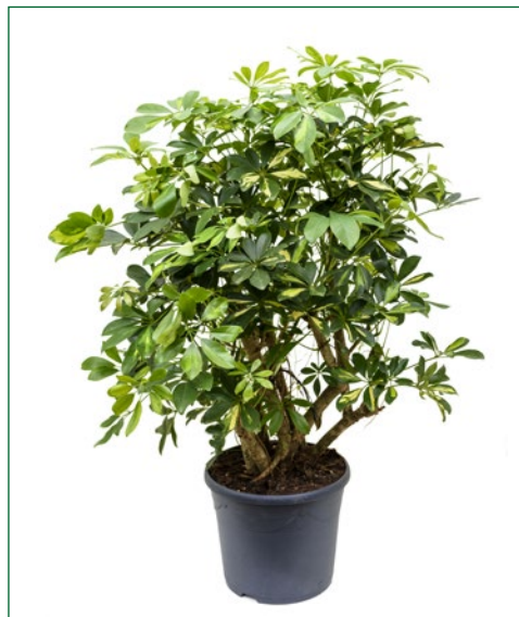
Artcode: 4SCGCVT12 Description: Schefflera gold capelle Variety: Branched Pot: 31 Height: 120