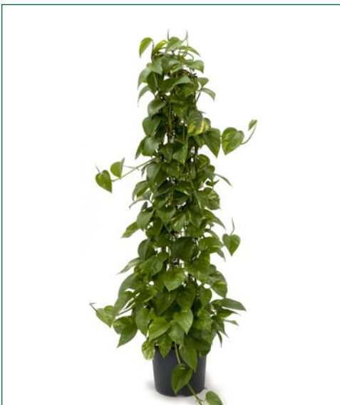
Artcode: 4SCAUZU03 Description: Scindapsus (epipremnum) aureum Variety: Column Pot: 26 Height: 120