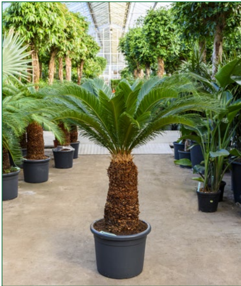
Artcode: 4CYRESS82 Description: Cycas Revoluta Variety: Stem (50-60) Pot: 40 Height: 140