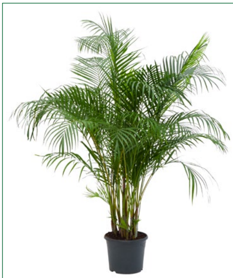
Artcode: 4CHLUBU08 Description: Areca (chrysalidoc.) lutescens Variety: Tuft Pot: 29 Height: 140