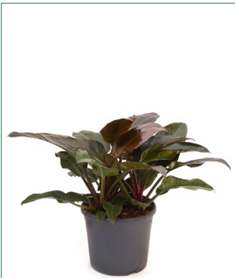
Artcode: 4PHIRBU22 Description: Philodendron imperial red Variety: Bush Pot: 35 Height: 80