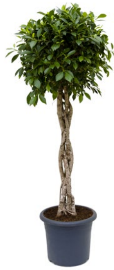
Artcode: 4FINIGS07 Description: Ficus nitida Variety: Stem braided Pot: 40 Height: 175