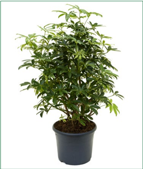
Artcode: 4SCARVT25 Description: Schefflera arboricola Variety: Branched Pot: 29 Height: 120