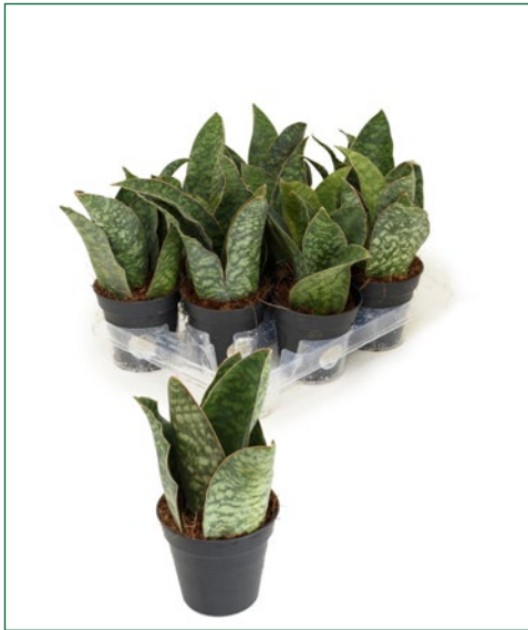
Artcode: 4SAGOTU01 Description: Sansevieria masiona gongo 9/tray Variety: Tuft Pot: 11 Height: 30