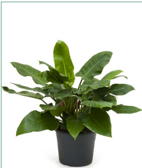
Artcode: 4PHIGBU25 Description: Philodendron imperial green Variety: Bush Pot: 35 Height: 90