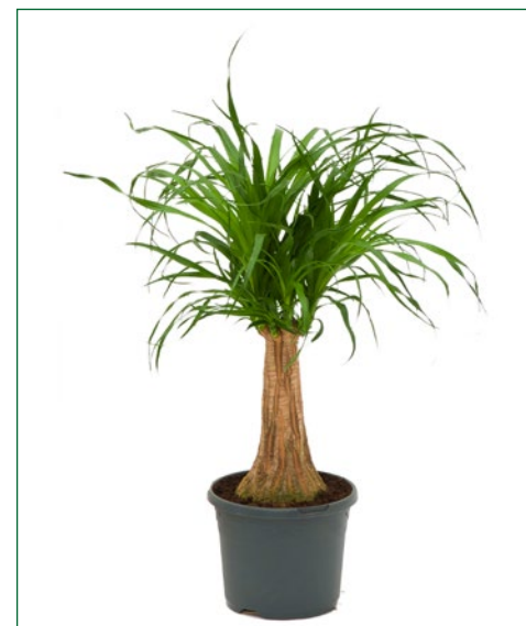
Artcode: 4BERERS40 Description: Beaucarnea recurvata Variety: Stem (25) Pot: 19 Height: 60