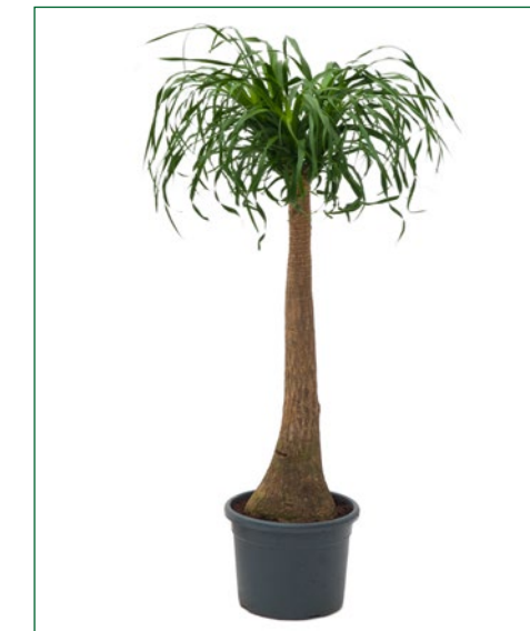
Artcode: 4BERERS50 Description: Beaucarnea recurvata Variety: Stem (80) Pot: 24+ Height: 125