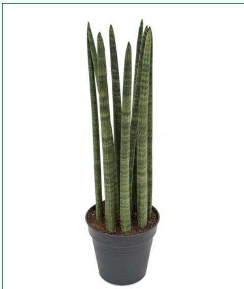
Artcode: 4SACSTU51 Description: Sansevieria straight Variety: Tuft Pot: 17 Height: 60