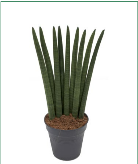
Artcode: 4SACWTU02 Description: Sansevieria wave Variety: Tuft Pot: 17 Height: 50