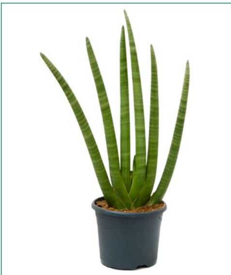
Artcode: 4SACYTU20 Description: Sansevieria cylindrica Variety: 5+ Leaves Pot: 26 Height: 85